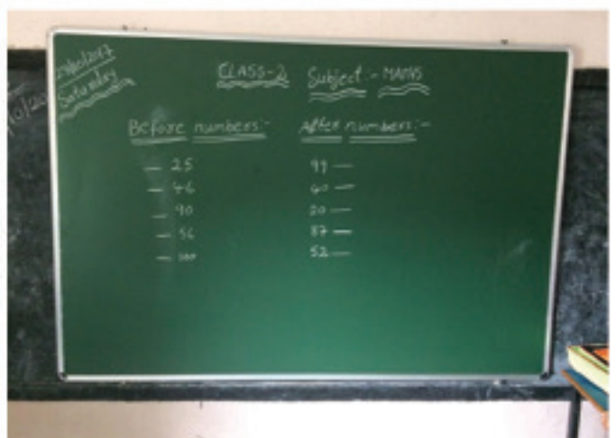
Green / Blackboards