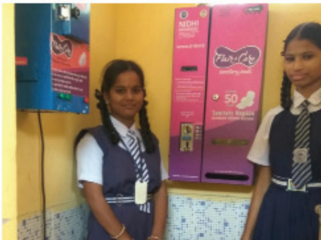
Pad vending machine