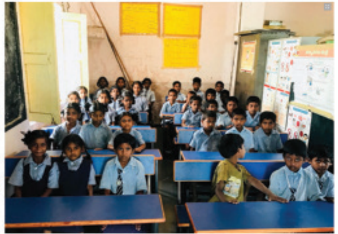
Students dual desk