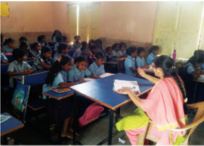
Teachers table / chair